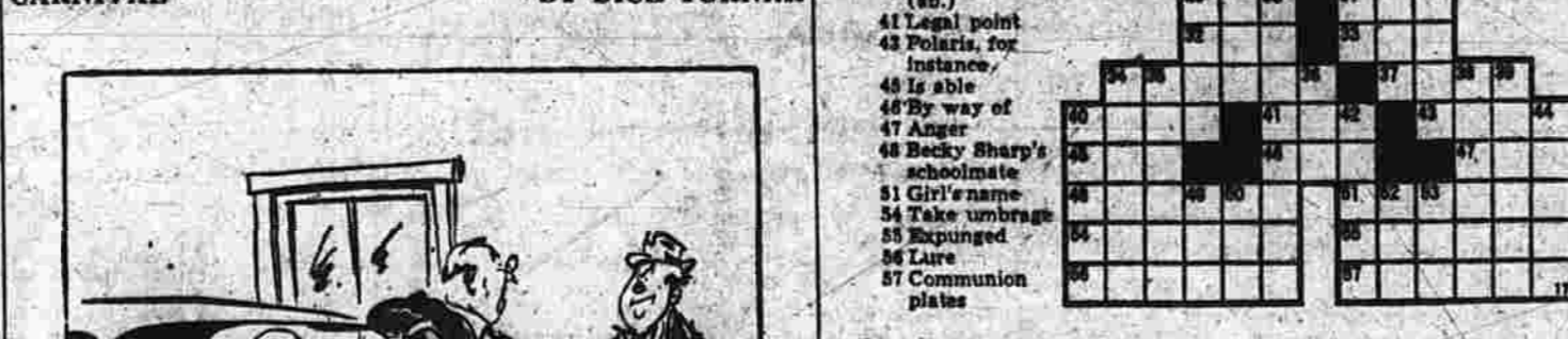
CARNIVAL BY FRANK O'NEAL