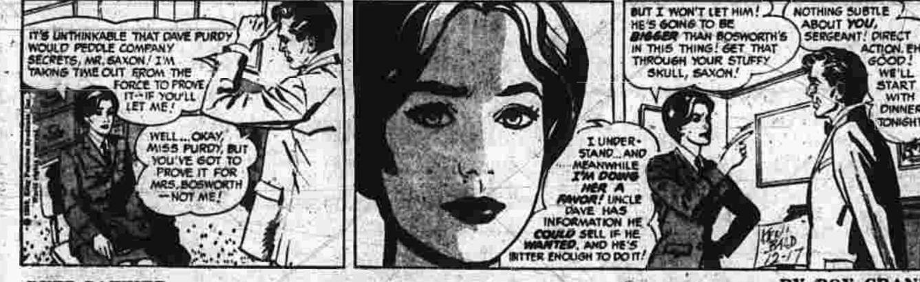
JUDD SAXON BY ROY CRANE