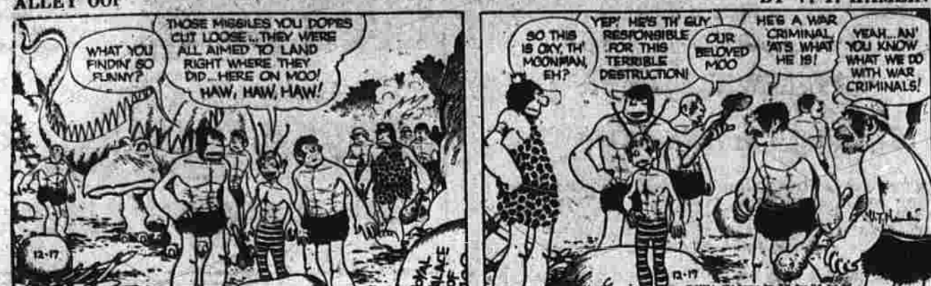
ALLEY OOP BY AL VERMEER