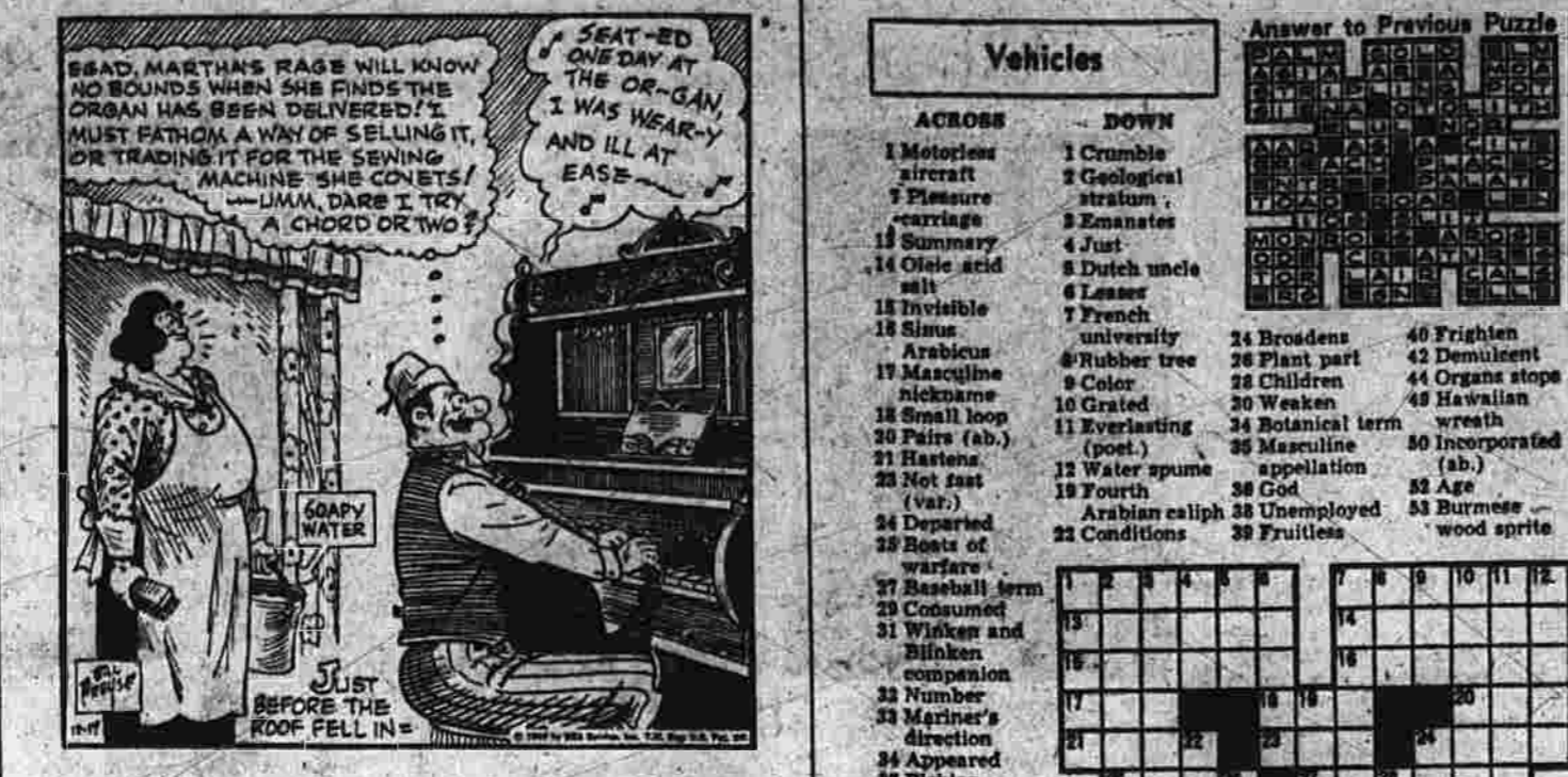
OUR BOARDING HOUSE with MAJOR HOOPLE BY DICK TURNER